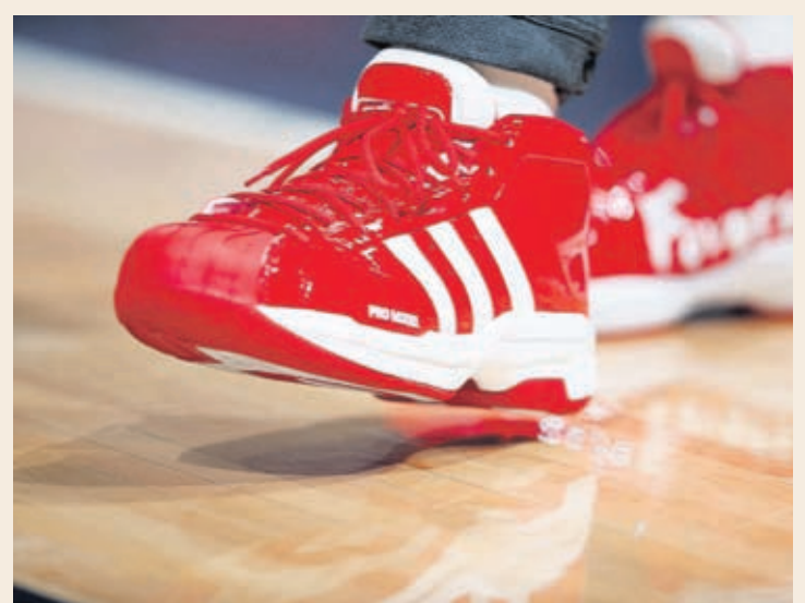
In this file photo dated Wednesday, Dec. 25, 2019, New Orleans Pelicans forward Derrick Favors wears Christmas-themed Adidas Pro Model Superstars shoes in the first half of an NBA basketball game Wednesday, Dec. 25, 2019, in Denver, USA.

"As a result, adidas is still not able to provide an outlook for the full year 2020 that includes this impact." □